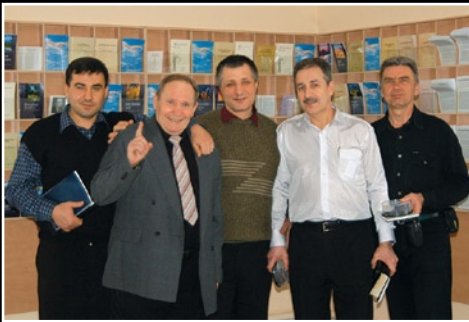
Left: Brothers in attendance at the ministers' meetings in Donetsk visit the church library to pick up DVDs and CDs of the meetings, as well as other resources, to take home with them.

As a result of meetings like this, the Message is spreading into the far corners of the Russian-speaking countries.