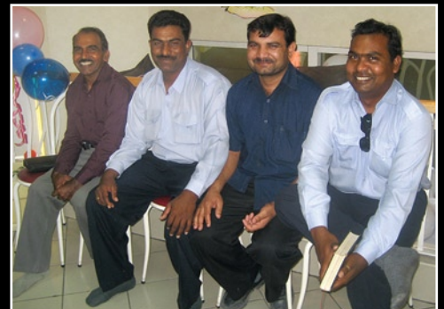
Above & below: Brothers who attended the meetings in Dubai