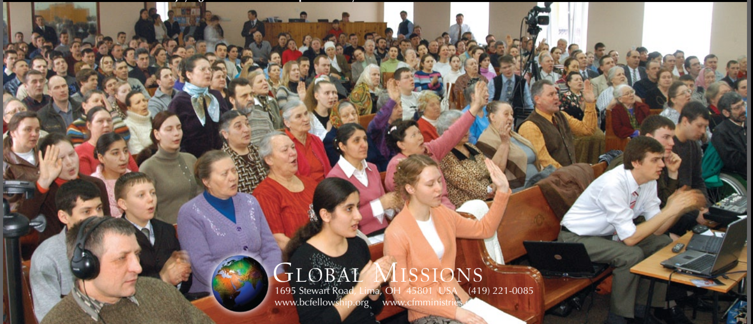
Below: Both brothers and sisters enjoying a service that was open to everyone.