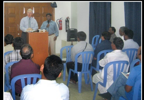
Church service in Dubai