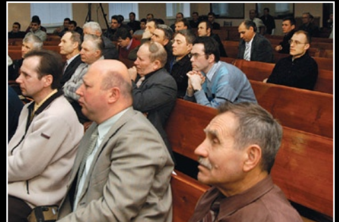
Above: Listening attentively to the Word during the ministers' meetings.