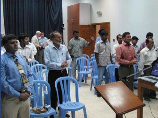
Men of various nationalities who work in Dubai attended the services