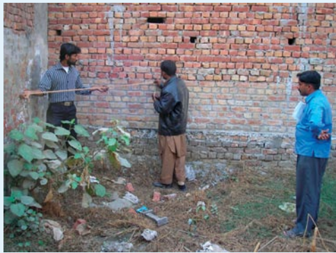
Measuring the land