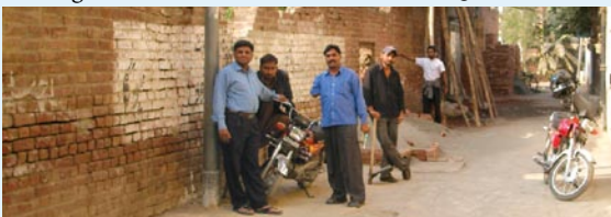
Standing on the site of the future church and outreach center in Lahore, Pakistan