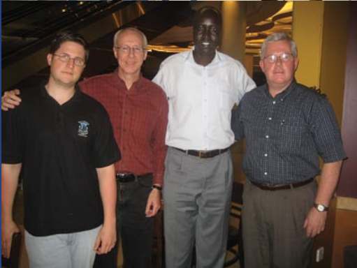
Meeting with a North African Arab, Bona, at a shopping center in Dubai