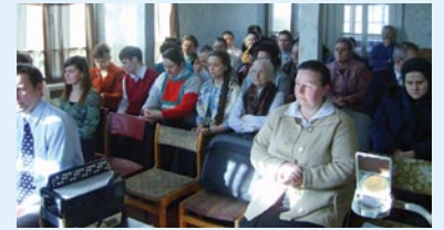
The Believers in Moscow