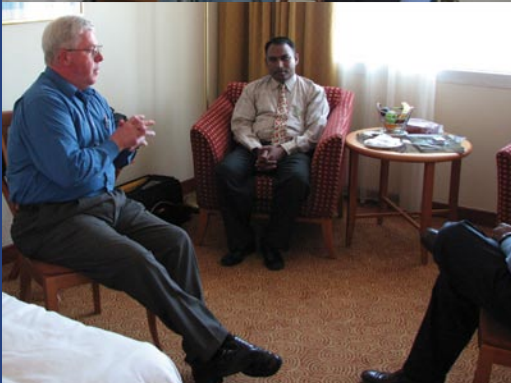
Questions and answers with Christians in Dubai