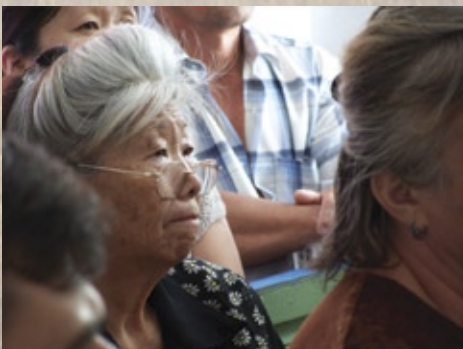
Listening intently during a church service

We are preparing to edit our film footage of the trip and will be producing a short DVD of the people and the services. Details on the availability of the film will be posted on our websites. Please remember these precious saints in prayer; it will be a pleasure to visit with them again in 2006.