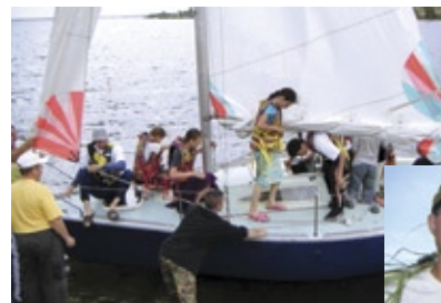
Preparation for sailing during Russian youth camp

The camp was conducted much as camps in the US. The children participated in games, skits, and competitions and attended services every evening. After the evening service, they all sat around a bonfire where the adults testified of how they met the Lord. Unlike youth camps in the US, rather than sleeping in dorms or cabins, the children slept in tents on the bank of a water reservoir; but though the conditions were somewhat primitive, the young people all enjoyed themselves and are eagerly anticipating another camp next year.