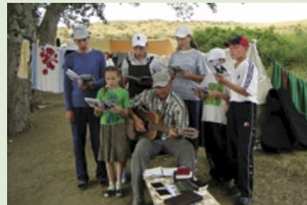
Singing at one of the youth camp services

While these gatherings are quite common in the United States where money, facilities, and basic freedom are more readily available, they are not as common in other nations. So when Believers in Russia were able to have a youth camp in August it was a precious time.