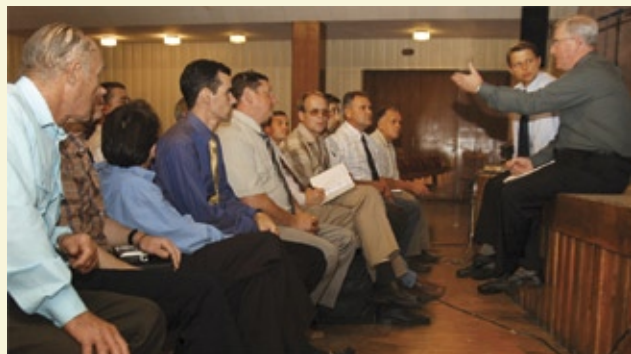
Left: Brothers discuss printing and distribution arrangements for Russian-speaking nations