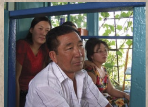
Believers listen during an informal question & answer session